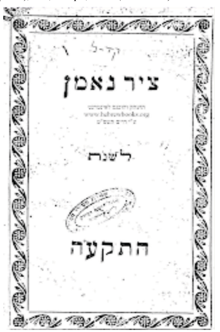
Appendix No. 1. Front page of the first Hebrew Youth yearbook/magazine, "Zir Neeman" ("Faithful Shepherd"), 1815, Ternopol, Galicia (now Ukraine). Editor: Pearl Y.