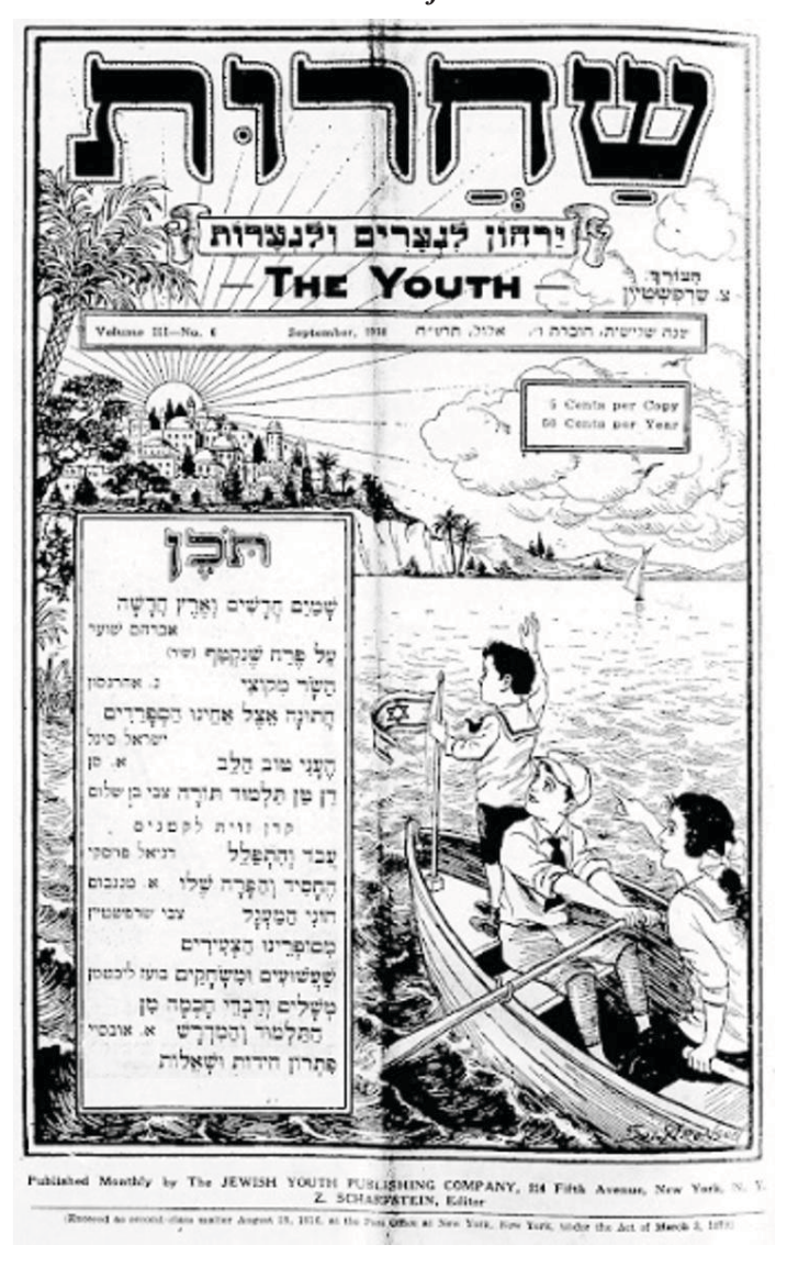
Appendix No. 2. Front page of the children's monthly newspaper "Shacharut", ("The Youth"), Vol. 3 No. 6, September 1918, the modern Jewish school "Downtown Talmud Torah", The fifth avenue 114, N.Y. Editor: Scharfstein Z.