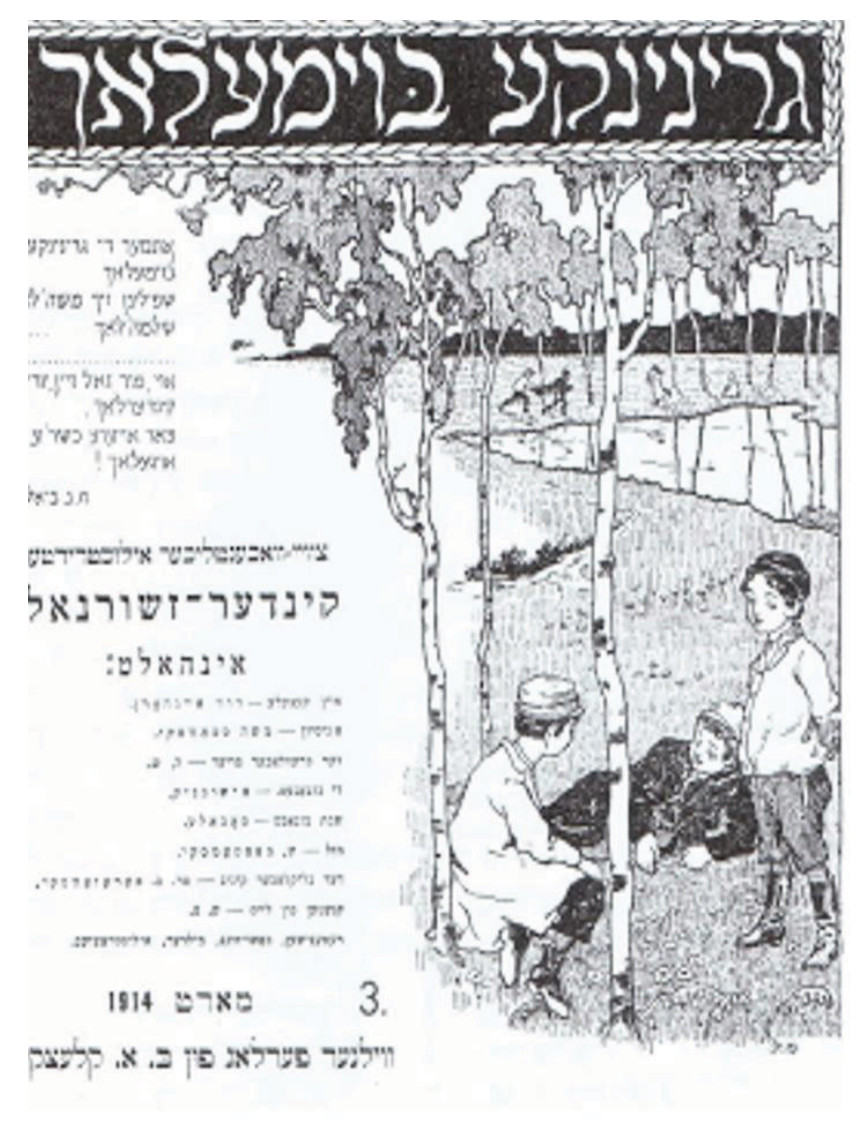
Appendix No. 4. The cover of the children's newspaper "Grininke Beyma'alach" ("Between the greenish trees"), Mars 1914, Vilna, Poland

שער העיתון 'גרינינקע ביימעלער', מרס 1814