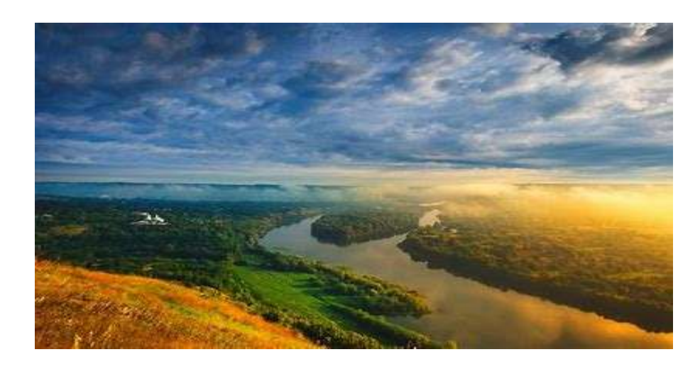
Revitalizing Green Tourism in Moldova: A New Era for Nature and the Country's Economy

Revitalizing green tourism in Moldova is an ambitious initiative aimed at transforming the country into a popular destination for nature lovers and adventurers. This movement focuses on harnessing Moldova's rich natural resources while promoting sustainable economic development and environmental protection.